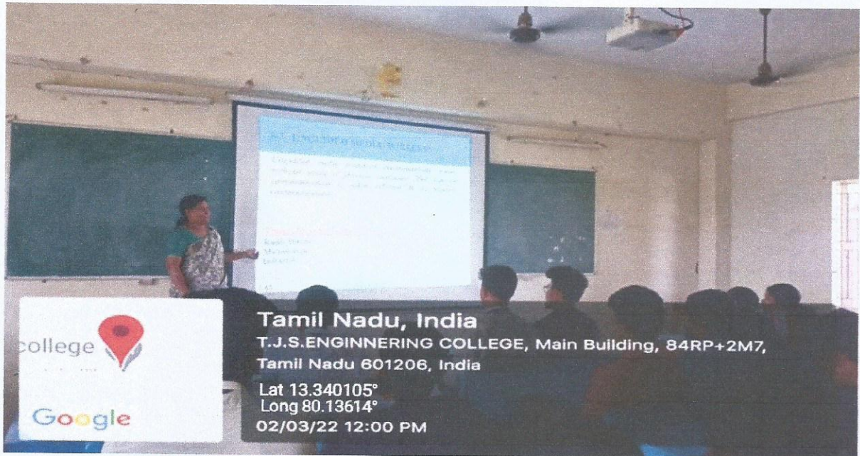
Room No. 302 - ICT Enabled Class Room (UG) 2 nd Year ECE