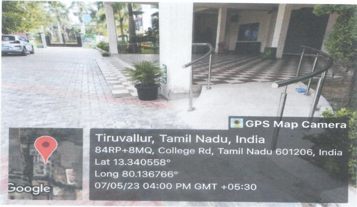
BUILT ENVIRONMENT WITH RAMPS