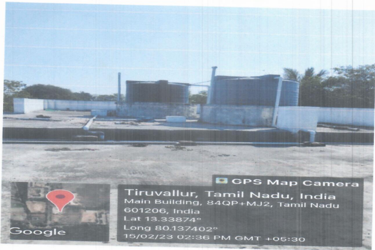
CONSTRUCTION OF TANKS AND DISTRUTION OF PIPE LINES