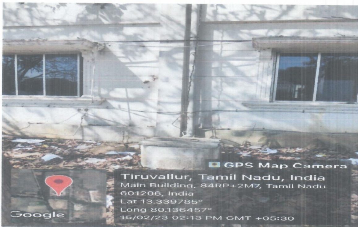
RAIN WATER HARVESTING OUT SIDE THE COLLEGE CAMPUS