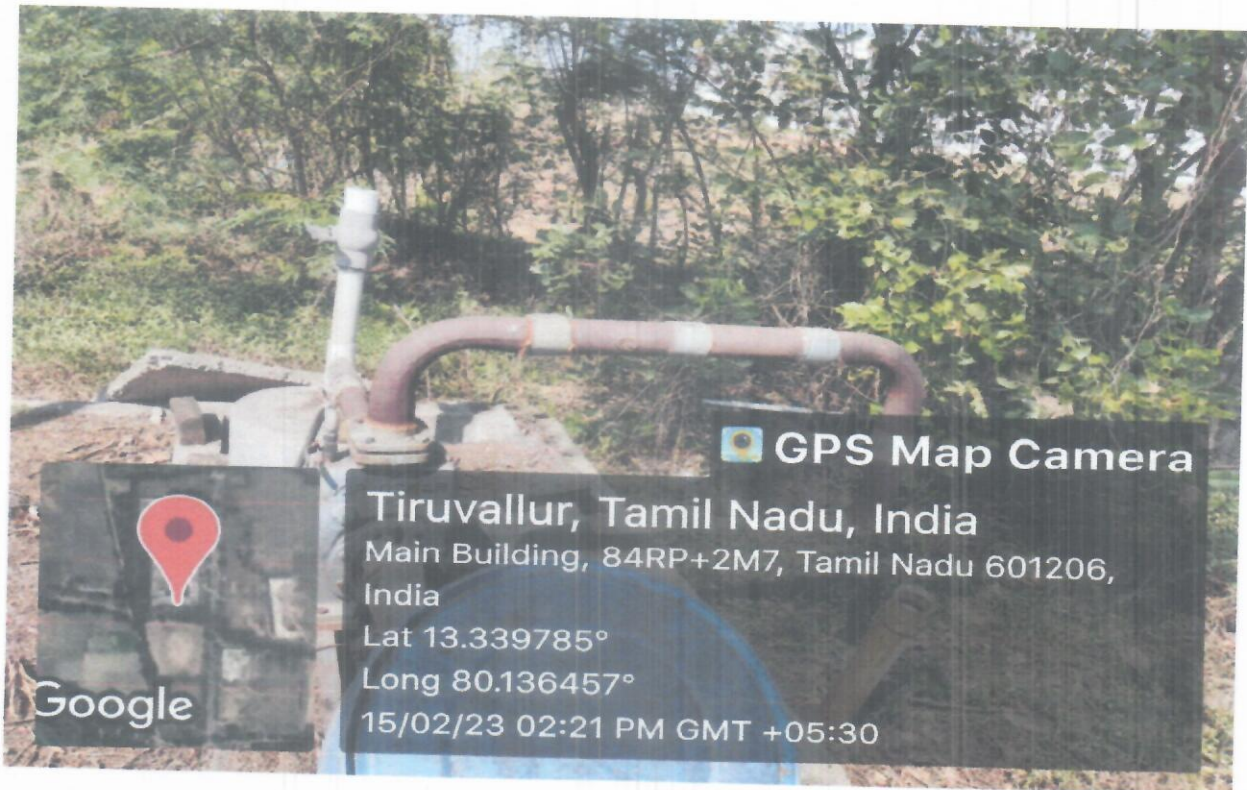
BOREWELL NEAR CANTEEN AREA