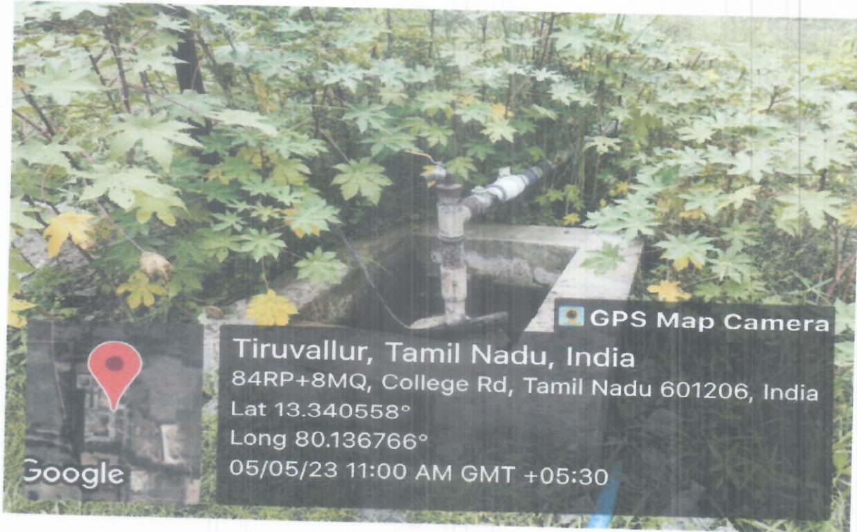
BOREWELL NEAR MAIN GATE