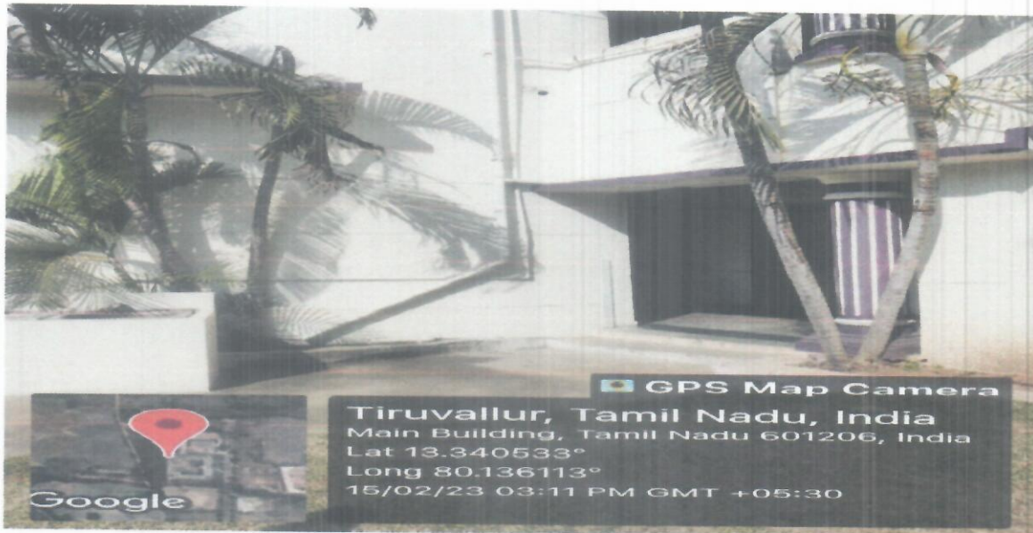
RAIN WATER HARVESTING INSIDE THE COLLEGE CAMPUS