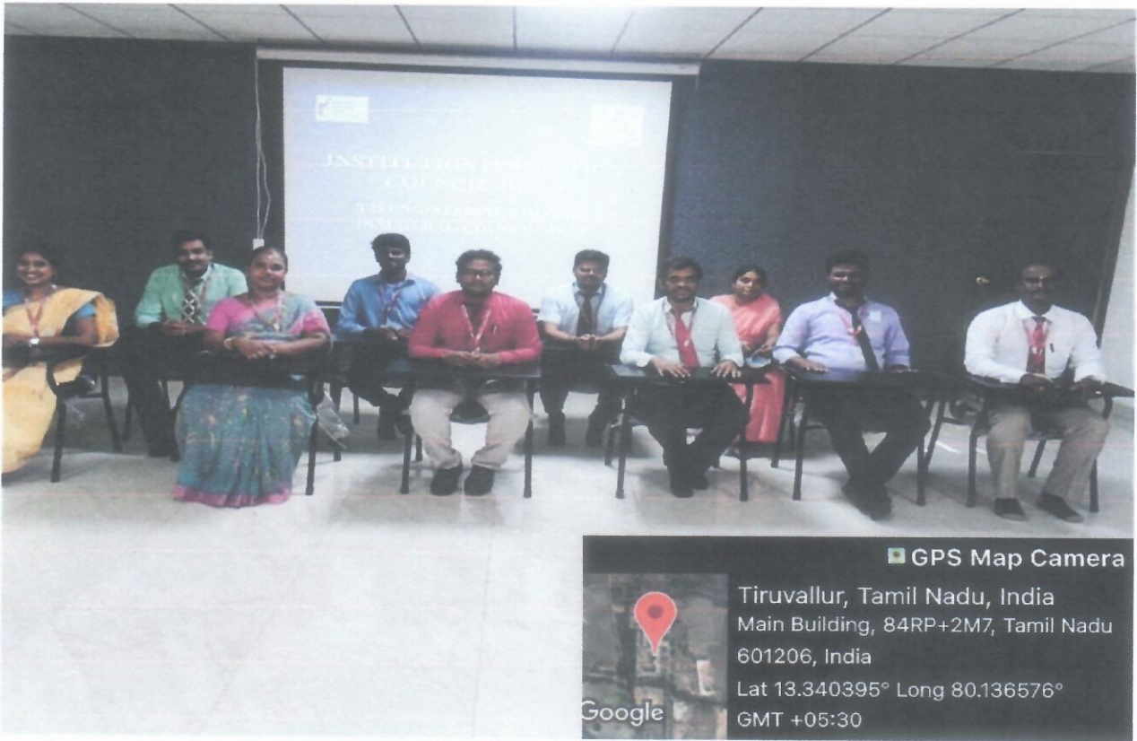
IIC INNOVATION COMMITTEE MEMBERS